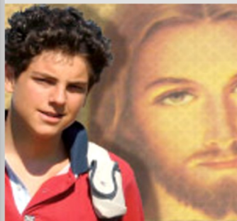
Born May 3, 1991, died October 11, 2006.

DON'T MISS THIS OPPORTUNITY This exhibit is the result of three years of research, compilation and design by Blessed Carlo Acutis. It displays 136 Eucharistic Miracles.